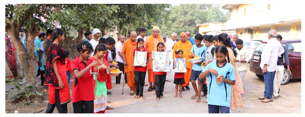
of Rs. 97,89,076/- and is completed in Dec., 2019.

The Golden Jubilee Vivekananda Bhavan is inaugurated on 1st January 2020. This new building, intended for advancing the youth activities of the samithi, is constructed at a cost