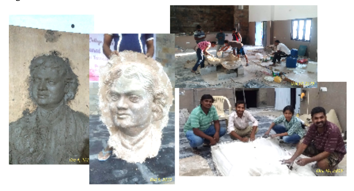
Voluntary work for the Bhavan