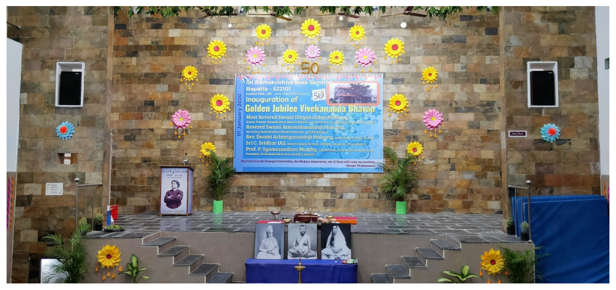
Inside the Vivekananda Bhavan ready for inauguration.